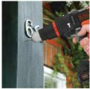
Drill Driver EDD183-JP