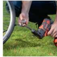
High Pressure Inflator EIFS183-JP