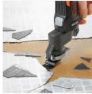
Oscillating Tool EOH183-JP