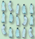
Tool Housing Made With Tritan™ Renew 50% Certified Recycled Material*

All the durability, performance, and safety you've come to expect from BLACK+DECKER® now with up to 50% certified recycled material*.