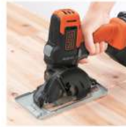
Circular Saw ECH183-JP