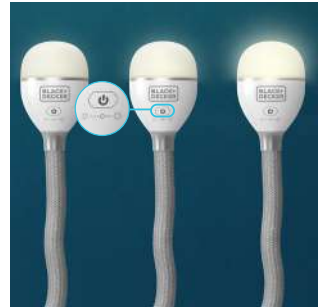
Press + hold power button to activate stepless dimming