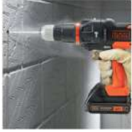
Hammer Drill EHH183-JP