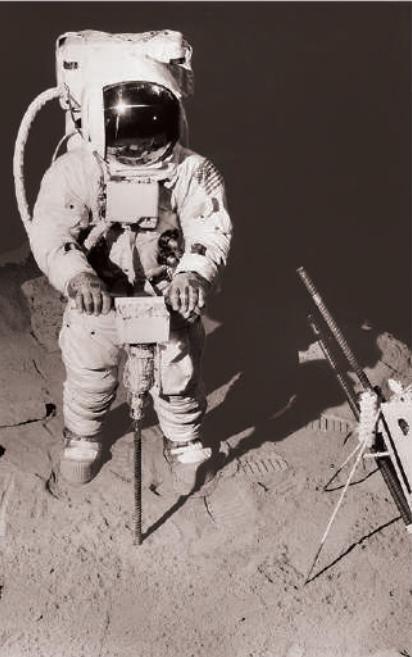
BLACK & DECKER developed a unique power head for drilling the lunar surface during the Apollo missions in 1971