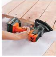
Detail Sander ESH183-JP