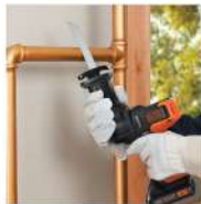
Reciprocating Saw ERS183-JP