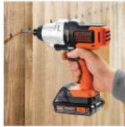
Impact Driver EIH183-JP