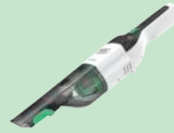
One BLACK+DECKER® reviva™ 7.2V Cordless Hand Vacuum contains an amount of recycled material* equivalent to the weight of 15 0.5L single-use plastic bottles**

*Recycled material is certified through a third-party mass balance allocation process.