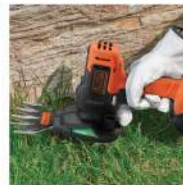
Hedge Trimmer + Shear GEH183N-JP